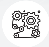
Motors and Machinery