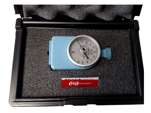
PTC® manufactures durometer test stands compatible with the 307L.

The instrument features a low glare serialized dial with bold, easy to read numbers. The durometer has a Max Hold hand which maintains the peak reading until reset. Each durometer comes complete with a test block and carrying case.