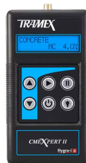
Product code: CMEX2