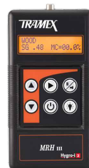
Product code: MRHIII