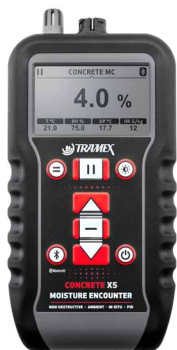
Product code: CMEX5

The Hygro-i2 ® probe is used with the CMEX5, Feedback DataLogger DL-RHTX, CMEX II or the MRH III for relative humidity testing of flooring slabs and ambient conditions. The Hygro-i2 ® probe is used to carry out in situ RH tests (ASTM F2170) and hood RH tests (British Standards 8201, 8203).