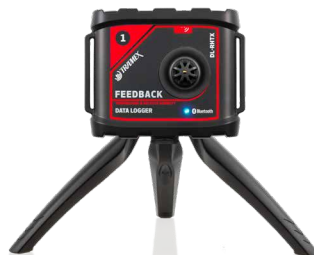
Product code: DL-RHTX