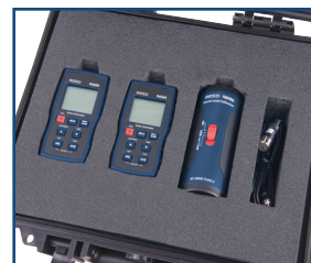
Includes: 2 x R8085 Noise Dosimeter, R8090 Sound Level Calibrator, and R8888 Hard Carrying Case