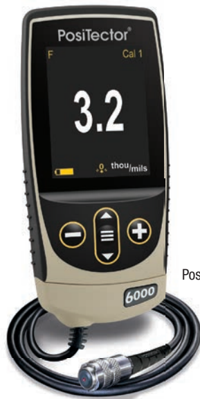
PosiTector 6000 FNS3