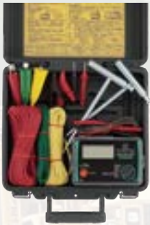
HARDCASE (KEW 4105A-H)